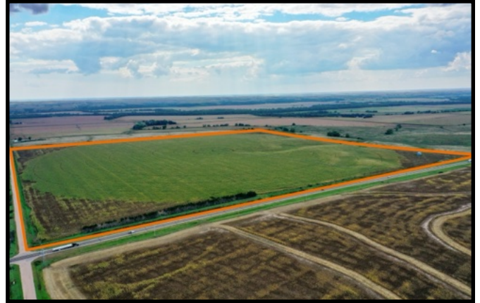
Maps are for illustrative purposes only — not intended to represent actual property lines.