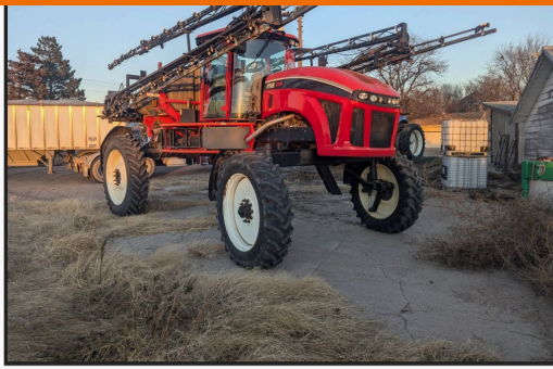
2011 Apache AS1020 Sprayer, 2,305 hours, 90/60 boom, 1,000 gallon tank, gear box drops, 50" clearance, Raven Viper 4 Pro monitor included, nozzles in picture not included, SN: 9120421