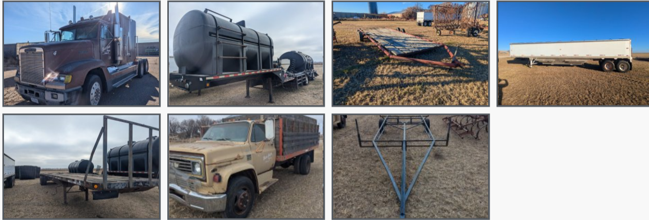
1989 Freightliner FLD120 Truck, VIN: 2FUVDXYB6KV372697, 970,389 miles