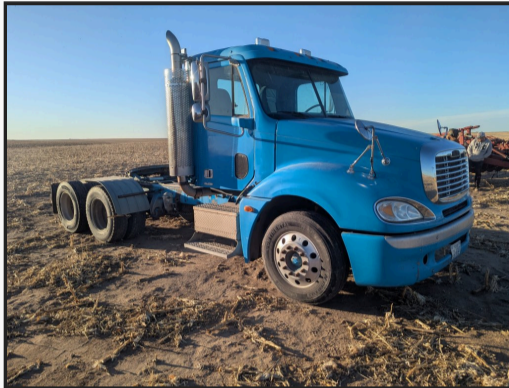
2003 Freightliner Columbia 120 Daycab Semi, CAT C-12, 10 spd., Air ride suspension, electric tarp hookup, Showing 1,001,892 miles, VIN: 1FUJA6AS93LK32791