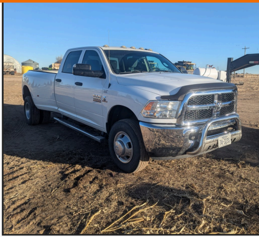
2015 Dodge Ram 3500HD Truck, 4x4, Dually, Diesel, Showing 67,000 miles, B&W Turnover ball hitch, Newer tires, 6.7 Cummins Engine, Automatic, back-up camera, engine brake, VIN: 3C63RRGL5FG621351