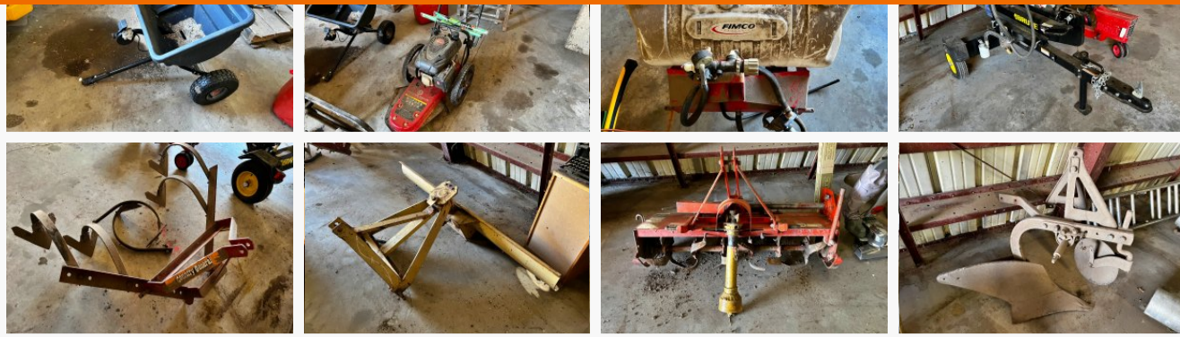
Kubota B2400 Tractor, diesel, Kubota LA351 loader w/bucket, 815 hours, 3 point, PTO, power steering, SN: 74087, 11.2-16 rear tires