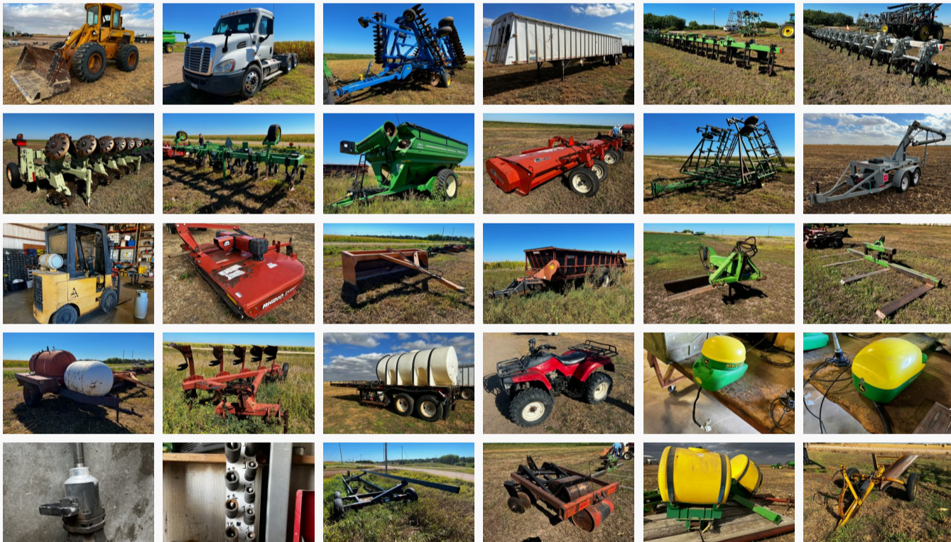
John Deere 644B Wheel Loader, 8ft. bucket, 20.5-25 tires, SN: 644BA400133DW