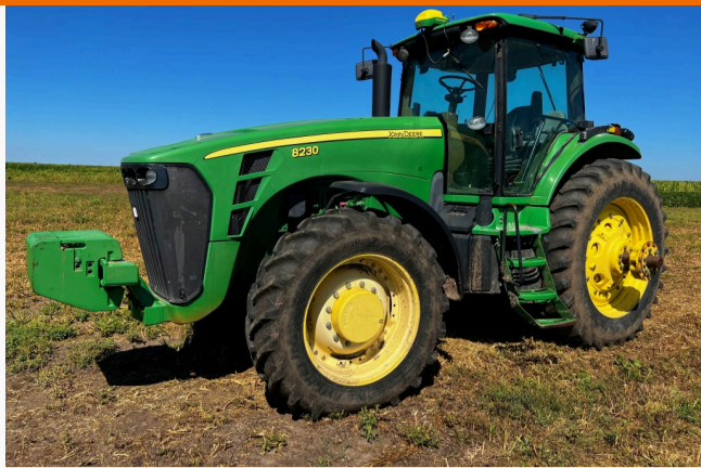
2007 John Deere 8230 MFWD Tractor, 4,834 hrs., rear wheel wts & spacers, 4 hyd., large 1000 PTO, hyd. 3rd length, 16 front weights, 480/80R46 rear dual tires, 380/85R34 front tires, SN: RW82300P15880