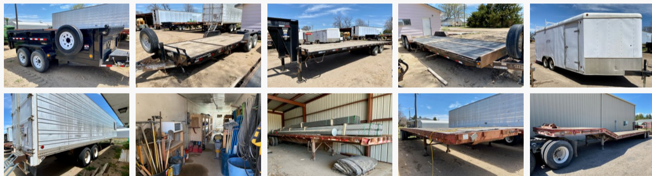
2018 PJ 14ft. dump trailer, (2) 7000lb. axles, spare tire, manual roll-over tarp, ST235/80R16