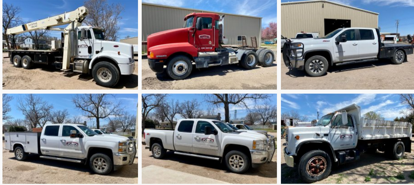
2003 Peterbilt boom truck, 9 spd., Cummins diesel, National 900A crane unit – SN: 34848, 385/65R22.5 front tires, 11R22.5 rear tires