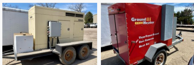
Kohler diesel generator on tandem axle trailer, 33KW, model 30R0ZJ, single 7 3 phase, SN: 610993, shows 320 hrs.