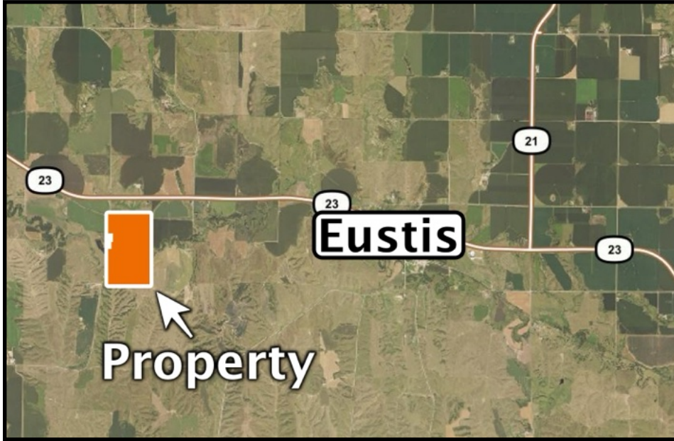
Maps are for illustrative purposes only — not intended to represent actual property lines.