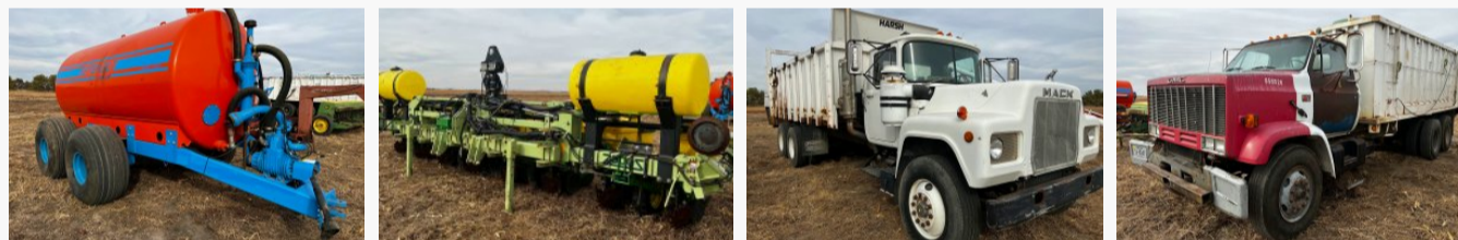
Better-Bilt by Top Air honey wagon/liquid manure spreader, SN: 15432