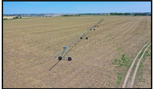
Maps are for illustrative purposes only — not intended to represent actual property lines.